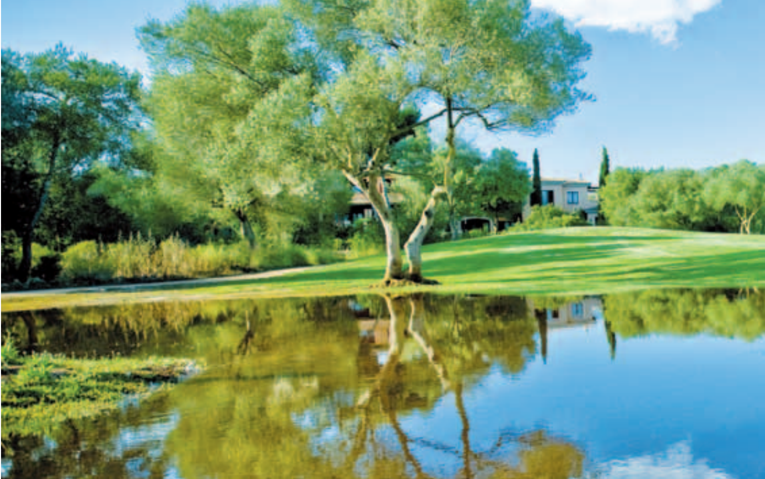
ABB SACE has always taken the ecological footprint of its products into account during each stage of their life: from production to disposal.

This is why the new SACE Tmax XT moulded-case circuit-breakers have been designed, developed and produced in accordance with the International EPD system (Environmental Product Declaration), with the aim of limiting the use of raw materials during the construction stage with consequent reduction of the material which will have to be recycled in future.