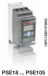
PSE18 ... PSE105