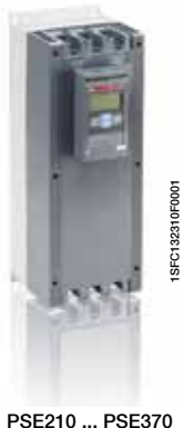
PSE210 ... PSE370