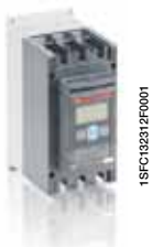
PSE142 ... PSE170