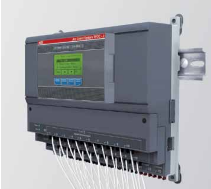
TVOC-2 mounted on DIN-rail