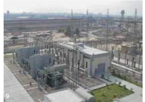
1 Cruise ship | 2 Oil rig | 3 Chemical industry | 4 Train | 5 Hospital | 6 Steel industry | 7 Wind power | 8 Papermill | 9 Substations

Arc Guard can be used almost anywhere there's a need to detect strong light.