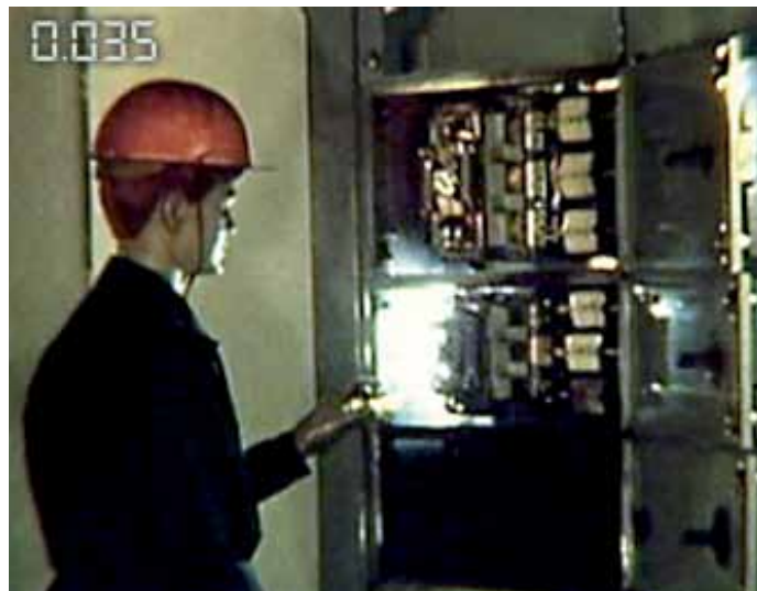
With ArcGuard System™