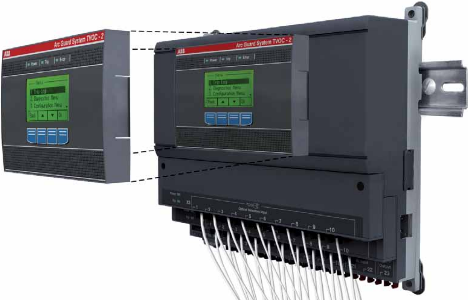
TVOC-2 showing the possibility to put HMI (Human Machine Interface) mounted on a panel-door.

A reliable, simple and flexible solution for you and your business safety.