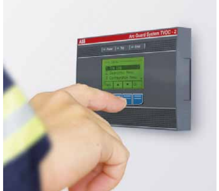
Human Machine Interface

To fit your application, we have added functionality to trip up to 3 breakers. If required, various selectivity can be applied depending on which sensor has triggered.