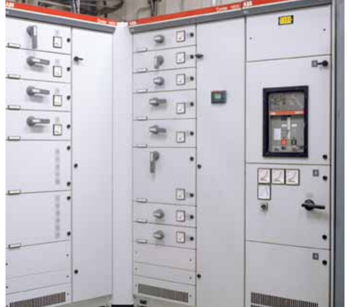
Arc Guard System™ — TVOC-2 installed in an ABB Low Voltage Switchgear

Using TVOC-2 means that you can meet the highest safety requirements! For example, NFPA70E, a US standard for the safe installation of electrical wiring and equipment, states: "a flash hazard analysis shall be done in order to protect personnel from the possibility of being injured by an arc flash. The analysis shall determine the Flash Protection Boundary and the personal protective equipment that people within the Flash Protection Boundary shall use." With Arc Guard System™, these calculations will show that the energy from an arc flash is decreased to an extent that reduces the need for additional protection. Note that the requirements for functional safety ensure the reliability of the figures used in these analyses.